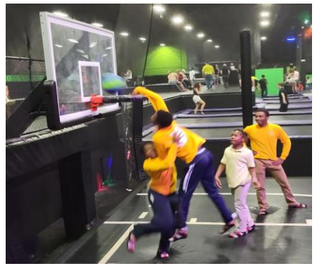
Savage dunking going on!

The men of the Honors Cohort had a lot of fun the first Saturday of March, when they had the chance to go to Defy for the first time. Defy is an indoor trampoline park equipped with all sorts of equipment where people can be challenged by an obstacle course, play trampoline basketball, and other games and fun activities. At right, we can see that the competition can be pretty intense as the trampolines give players a rare chance to be able to do some seriously monster-grade slam-dunks. Fortunately no one was injured...except possibly in the personal pride department! Defy was a lot of fun and our young men will likely return there again soon. Would you like to join us? Why not ask about joining the LDI today?